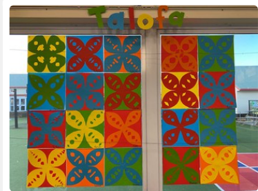
C7s Tapa cloth from Samoan Language Week